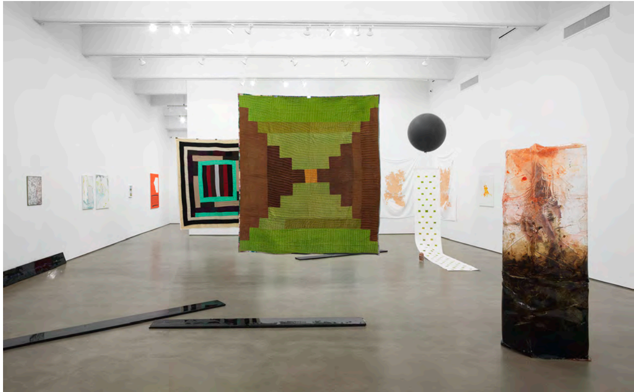
Installation view, Context Message , 2012 at Zach Feuer Gallery, New York

Painting is a lot of things: resilient, vampiric, perverse, increasingly elastic, infinitely absorptive and, in one form or another, nearly as old as humankind. One thing it is not, it still seems necessary to say, is dead.