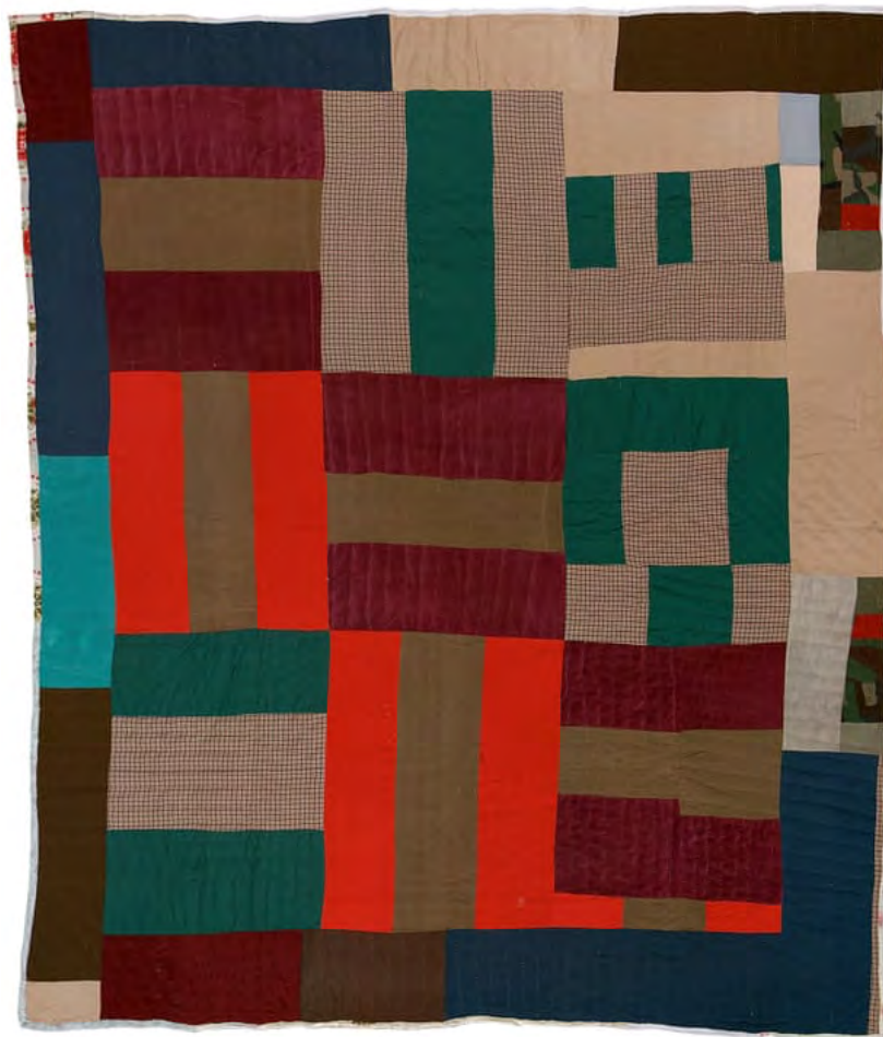
Basket Weave Variation by Mary Lee Bendolph (c 1990).

When the wildly distinctive quilts made by generations of rural women in Gee's Bend, Alabama, went on display in New York, one critic called them "some of the most miraculous works of modern art America has produced".