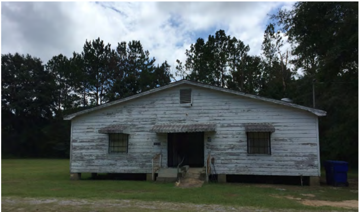
The Collective.