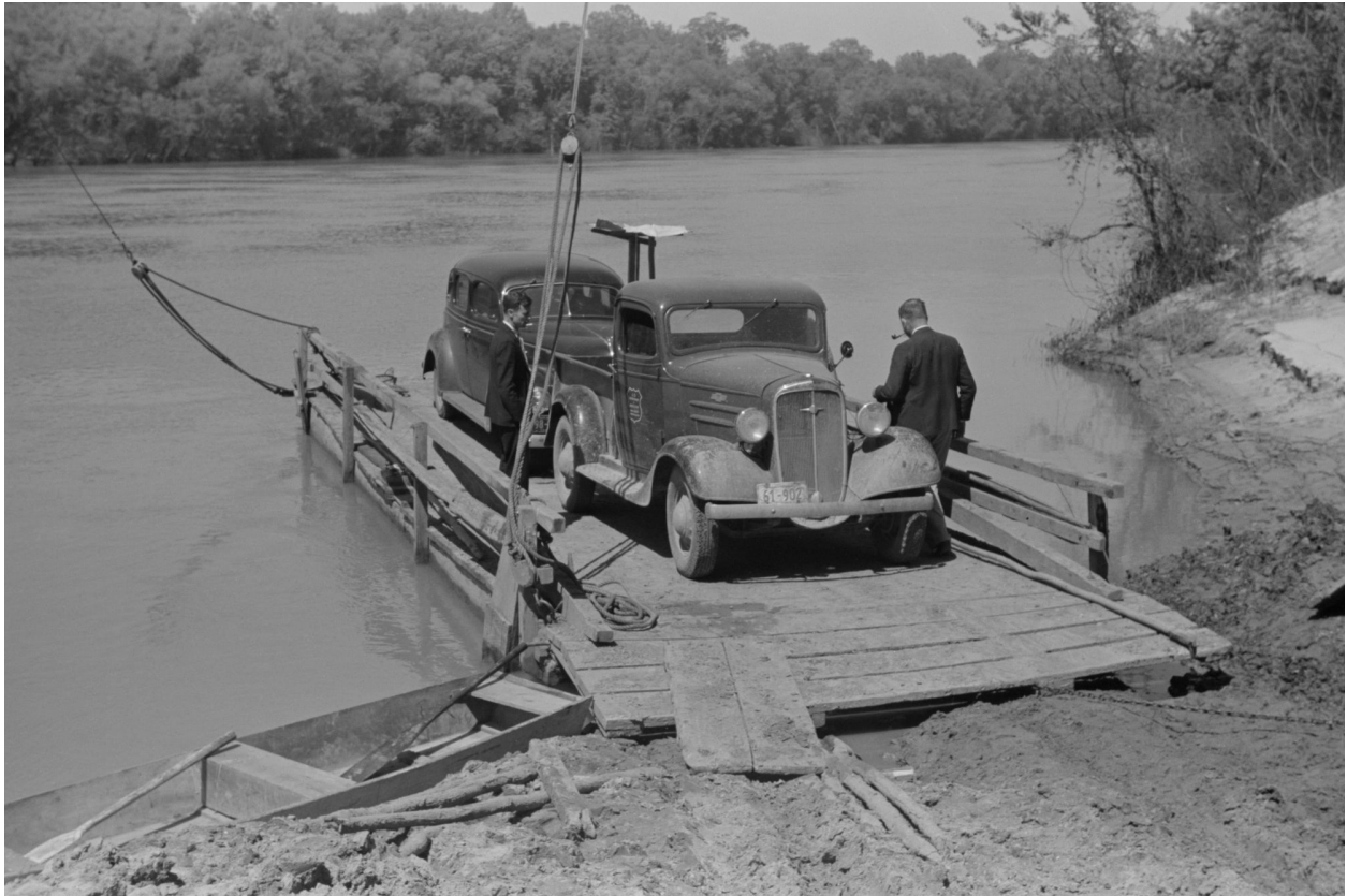
The car ferry at Gee's Bend, May 1939. White county government ended the ferry service in the 1960s to discourage voter registration.

When I arrived, the Ferry to Gee's Bend was closed. "PLEASE PARDON OUR PROGRESS!" A sign reads. "THE FERRY IS CLOSED WHILE IT IS CONVERTED TO AMERICA'S FIRST 100% ELECTRIC FERRY VESSEL!" After the local white officials took it away in the '60s, it wasn't until 2006 that a ferry was reinstated between Gee's Bend and Camden, 40 miles by car, but just seven by water. Now, it's often used by tourists visiting Gee's Bend to see the quilts and their makers.