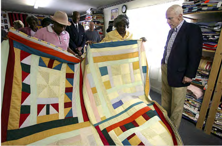
Members of the Gee's Bend Quilters Collective and John McCain.

GEE'S BEND, Ala. — Senator John McCain was serenaded with old Negro spirituals by the quilters of Gee's Bend, Ala., on Monday as he and his campaign entourage made a slow-moving trip by ferry in this isolated, overwhelmingly Democratic pocket of the state.