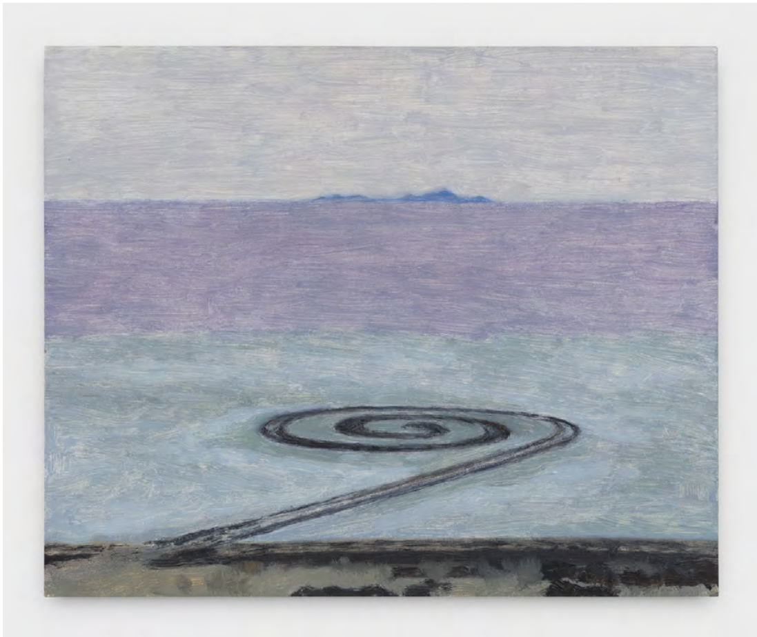
Eleanor Ray, Spiral Jetty, 2017, Oil on panel, Nicelle Beauchene Gallery.

One might think this an unlikely collection of subjects: what brings these twentieth-century “minimalists” together with the Italian frescoers of centuries yore? Impossible to know for sure, but I’d venture that Ray was drawn to the way that each artist is deeply concerned with art’s ability to transform the space it inhabits. Thought of in this way, they are natural subjects for a painter so concerned with evoking the dramatic potential of architectonic and landscape spaces. Further, whether secular (Judd and Smithson), religious (the Italian muralists), or somewhere between (Martin), these artists share a deep-seated, even existential belief in the metaphysical potential of their work. This powerful conviction is especially surprising to consider against the materially diminutive nature of Ray’s own works.