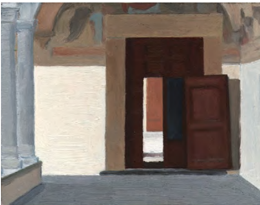
Eleanor Ray, “San Marco” (2013), oil on panel, 5 7/16 x 7 in (click to enlarge)

makes every element count; she captures a group of houses — jostling in various degrees of half-light — within shadows that are in turn circumscribed by sunlit planes: worlds within worlds. A handful of colors tell us what it means to be earth and sky — or more exactly, this earth and sky.