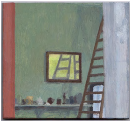
Eleanor Ray, "Atelier Cézanne, Aix" (2015), oil on panel, 5 1/4 x 5 3/4 inches

Ray uses a limited palette that often runs from whites and grays to blues and browns, with bits of red and yellow popping up like flowers in a plain room. Her desaturated colors share something with those employed by the great Danish painter Wilhelm Hammershoi. Her often chalky colors evoke autumn and winter, while the subdued light infuses many of her views with a melancholic whisper. Typically, Ray employs the architecture of her subject (walls, windows, doorways) to divide the painting's surface into distinct areas, with careful attention paid to solid and transparent surfaces, tonal and coloristic shifts, light and shadow. Within the order established by the subject's structure, she is keenly attuned to what interrupts and inflects the proportions. The tension between flatness and space locks many of Ray's paintings into place, makes us aware that we are looking at and through things. In some works, she seems to want to paint the dusty air of an uninhabited room where a wan sun is casting its light.