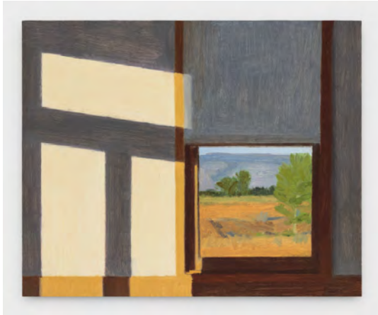
Eleanor Ray, "Wyoming Window, June" (2018), oil on panel, 6 1/2 x 8 inches

In the companion painting, the rectangles are salmon-colored and aligned vertically and horizontally, echoing the architecture. In both paintings, the rectangles of light reflected on the cool, dark wall are as palpable as the architectural elements. Their fleeting presence reminds us that we exist in time, even if we think of this moment as timeless.