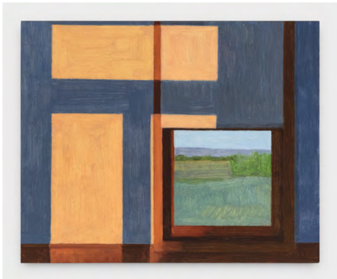
Eleanor Ray, Wyoming Window, June , 2018, oil on panel, 6 1/2 x 8".