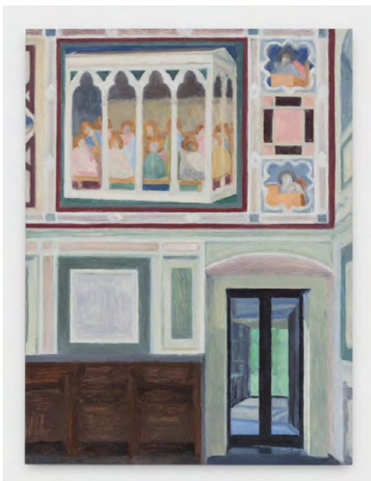
Eleanor Ray, "Scrovegni Chapel, Padua"

As much as we might read this configuration formally, it seems to me that Ray's evocation of the two spaces (interior and exterior) can be interpreted a number of ways. The unoccupied interior or landscape becomes a sacred space, a place of solitude and reflection. The windows remind us that there is an exterior and interior world, and that we always occupy both.