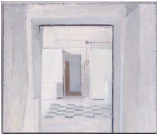
Eleanor Ray, "Sculpture Studio" (2015), oil on panel, 7 x 8 inches

Ambition has nothing to do with scale. The largest painting in Eleanor Ray: paintings at Steven Harvey Fine Art Projects (November 18–December 24, 2015) measures 10 x 8 inches. Rather than a sign of the artist's modesty, I see Ray's intimately scaled paintings as an implicit rebuke of the art world's current obsession with McMansion scale.