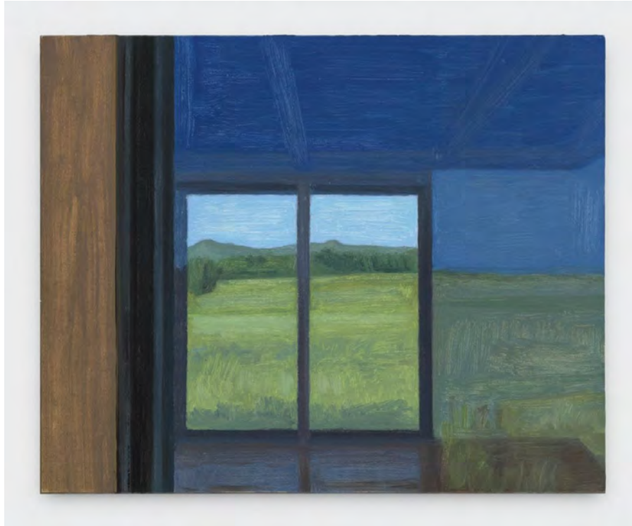
Eleanor Ray, View Through Studio (Great Basin Desert), 2020, Oil on panel.

“Eleanor Ray,” at Nicelle Beauchene Gallery (through June 5): In 2019 I wrote about Eleanor Ray’s first solo exhibition of paintings at Nicelle Beauchene Gallery. Now the artist is showing again with the gallery, in their new space on Franklin Place in Tribeca. Ray’s small paintings, many of which probe relationships between the natural landscape and man-made geometries, are light-filled, evocative, and perceptually astute. They engage with both the generalizing distillation of memory and the particularity of first-hand experience. Though instantly seductive, several are, sneakily, quite strange. Fortuitous snapshot views begin to seem possibly artificial. In View Through Studio (Great Basin Desert) , a landscape seen through a floor-to-ceiling window appears magically to “continue” through the opaque wall of the interior space. (Is this itself the reflection of a much closer window, through which the entire scene is viewed? I thought of Lois Dodd’s View through Elliot’s Shack Looking South, 1971 .) In Western Meadowlark , the cadmium yellow of the tiny eponymous subject’s belly seems to mirror the painted pole on which it is perched. Divergent lines and colors merge and intersect, upsetting easy understandings of light and space, asking us to look again.