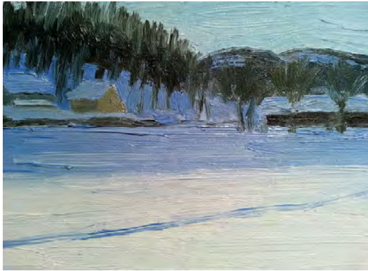
Eleanor Ray, “Woodstock Snow” (2012), oil on panel, 5 3/8 x 6 7/8 in

than their style or subject matter. These have to do with the historically intrinsic and unique powers of painting. Ray possesses a keen sense of the weight of color; she weights hues so that they tangibly embody, rather than merely denote, the visual aspects of a scene.