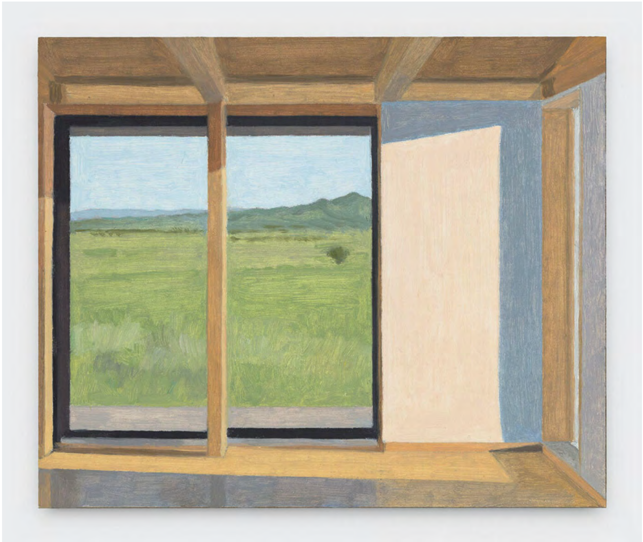
Eleanor Ray, June Windows (Great Basin Desert) , 7.25 × 8.5 inches, 2020.