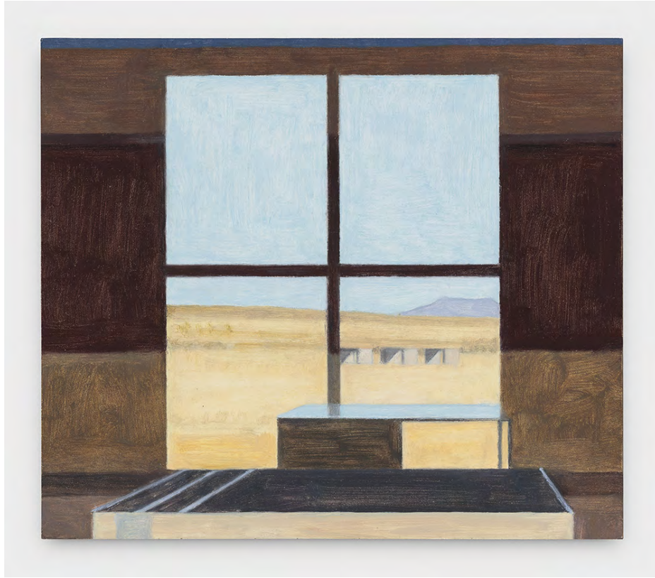
ELEANOR RAY, MARFA WINDOW , 2018.

In Marfa, Texas, three hours into the desert from El Paso, the artist Donald Judd installed a hundred geometric sculptures in two disused artillery sheds. Arrayed in a grid are boxes made of milled aluminum, all the same size but each uniquely composed with different patterns of segmented space. Through the sheds' massive windows, sun and blue sky and yellowed scrub reflect on the aluminum at shifting angles. As you walk through the space, it becomes hard to tell whether you're looking at a solid sheet of metal or only the illusion of one, created by light.