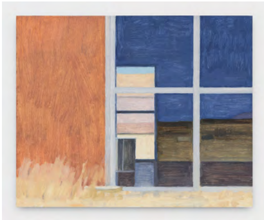
Eleanor Ray, "Marfa Exterior" (2018), oil on panel, 6 1/4 x 7 3/4 inches

frescos by Giotto; the Convent of San Marco in Florence, with its frescoes by Fra Angelico; views of the hills and fields of Wyoming and New Mexico.