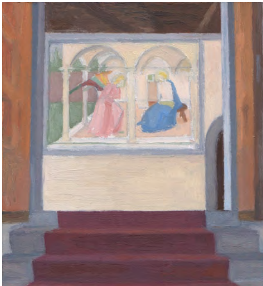
Eleanor Ray, "San Marco Stairs" (2014), oil on panel, 6 x 5 1/2 inches

own practice. In this regard, she is fearless and open rather than egotistical and competitive.