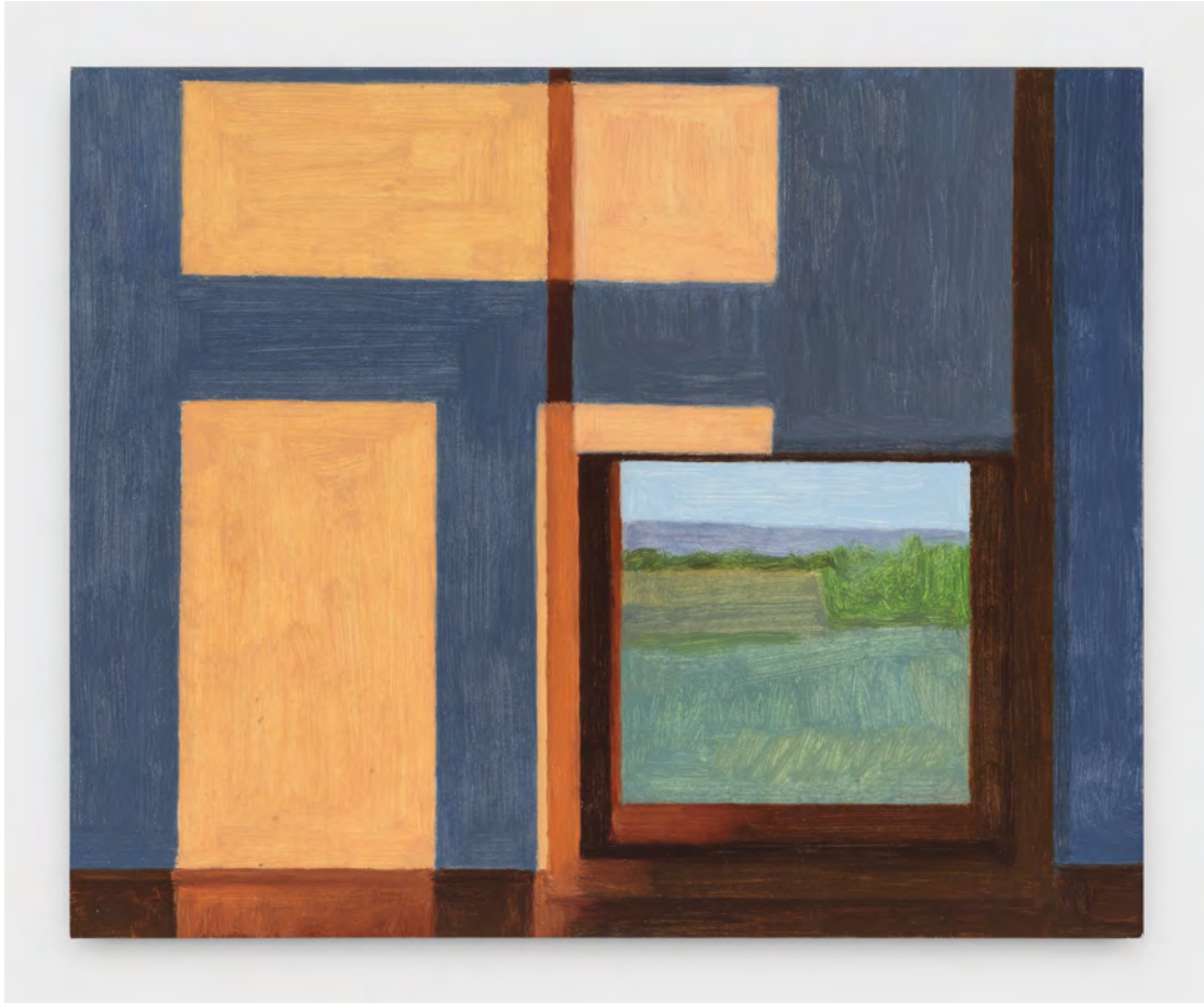
Eleanor Ray, Wyoming Window, June, 2018, Oil on panel, Nicelle Beauchene Gallery.

and geometrical paintings of windows and windowpanes. But each panel also demands that you get up close, to understand better how the subtleties of its pale color and evocative brushwork alternately harmonize with and push against the overlaying drawing. If there's a didactic element to these paintings, it's to show how deceptively open and complex a small and "ordered" painting can be.