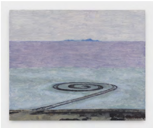
Eleanor Ray, "Spiral Jetty" (2017), oil on panel, 6 1/2 x 8 inches

I will say it again: I am an unabashed fan of Eleanor Ray's modest-sized paintings of interiors, exteriors, and the landscape. While I have followed her work for the past few years, and have written about it twice before, I realized that her debut exhibition at Nicelle Beauchene Gallery (January 6–February 10, 2019), simply titled Eleanor Ray , encompassed the largest number of her works that I