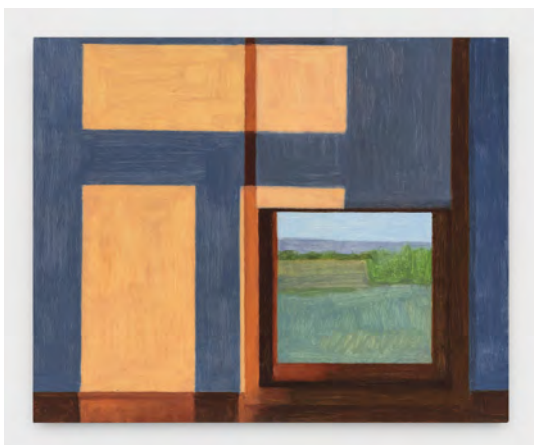
Eleanor Ray, “Wyoming Window, June” (2018), oil on panel, 6 1/2 x 8 inches

Ray uses thin textured paint, sometimes applied in layers, whose grained surface prevents us from reading the work as purely optical or solely as image. She is interested in light and reflection as palpable presences in a restrained, sensual world. The cropping makes us aware that the view is partial — we are seeing only a piece of the room we are standing in, while the window before us frames the landscape, allowing us to see only a small section of that as well. An open door reminds us that there is another room we have not entered. Standing outside, with the corner of a porch and the plains before us, we are reminded of the vastness of the world. There is a deep, warm solitude running through all the paintings in the exhibition – a sense of being alone and luxuriating in the human silence and changing light.