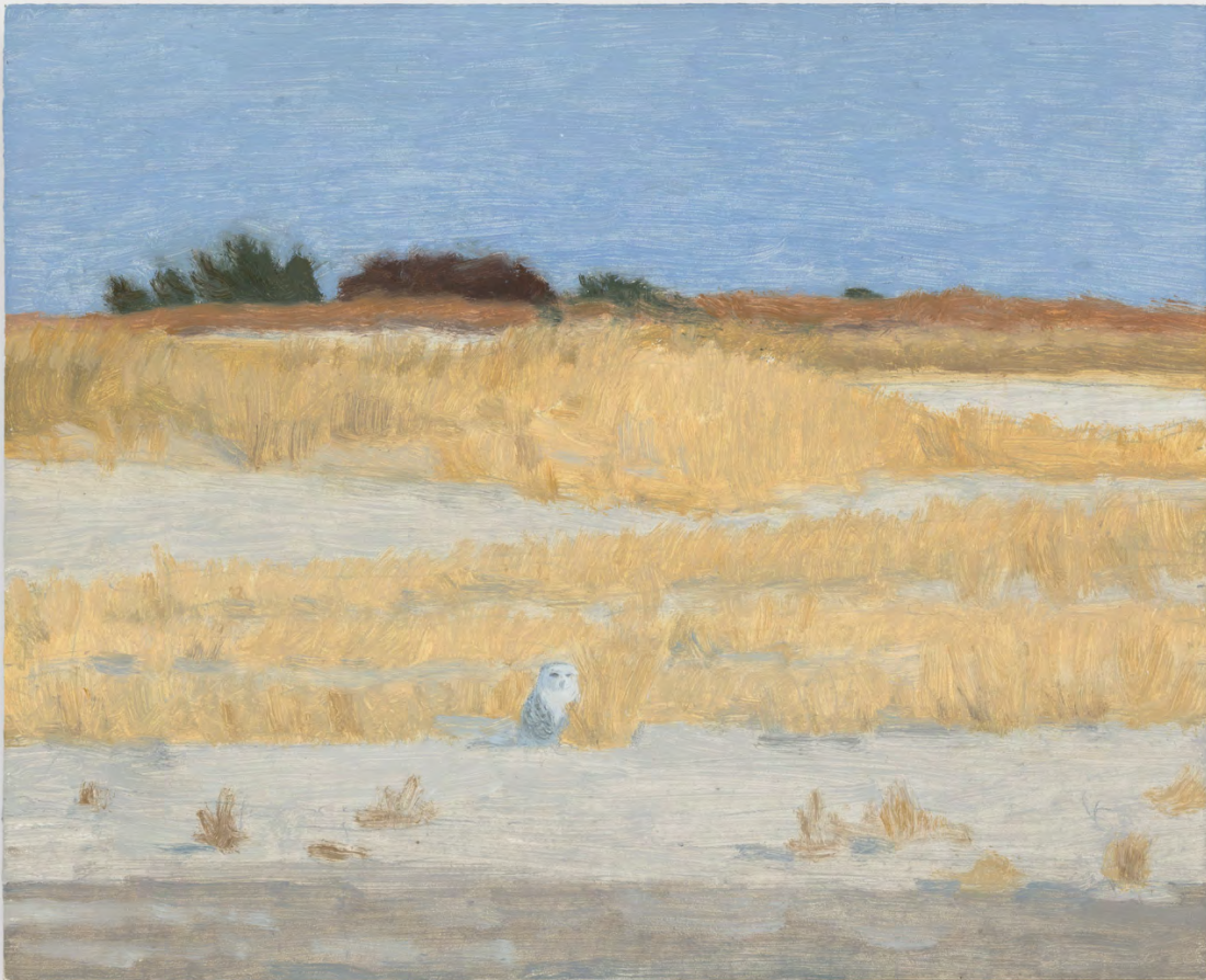
Eleanor Ray, "Snowy Owl", 2020

Ray's second solo show at Nicelle Beauchene Gallery is open through June 5. Surrounded by long stretches of white wall, the paintings themselves appear as tiny windows onto various moments. ARTnews talked to the painter about her choice of subjects, turning landscapes into images, and what French TV show she's been watching during the pandemic.