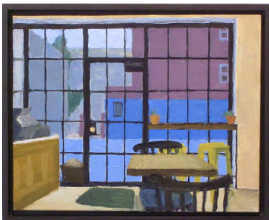
Eleanor Ray, “February Windows” (2014), oil on panel, 5 3/8 x 6 7/8 in

But when Ray hits the mark, the results are quite stunning. “Big Painting Studio” (2013) palpably captures, in warm and cool grays, the solemn luminosity of tall walls rising above the small darks of chairs. Its discreet radiance recalls Vuillard. Almost as compelling is “February Windows” (2014), an exuberant tussle between the horizontals and verticals of a coffee shop's interior. Viewed through the floor-to-ceiling window, the street and buildings outside become medium-blues, dense and deep enough to turn the dull ochres of tabletop, wall, and floor into buoyant notes. Surrounded by chair backs and intervals of the blue street, the beige of the table hovers deliciously in space. The painting's densest warm note — the side of the counter — deflects the speeding horizontals of table, floor, panes of window. Echoing these streaming rhythms, two orange-red flowerpots anchor either end of a long shelf.