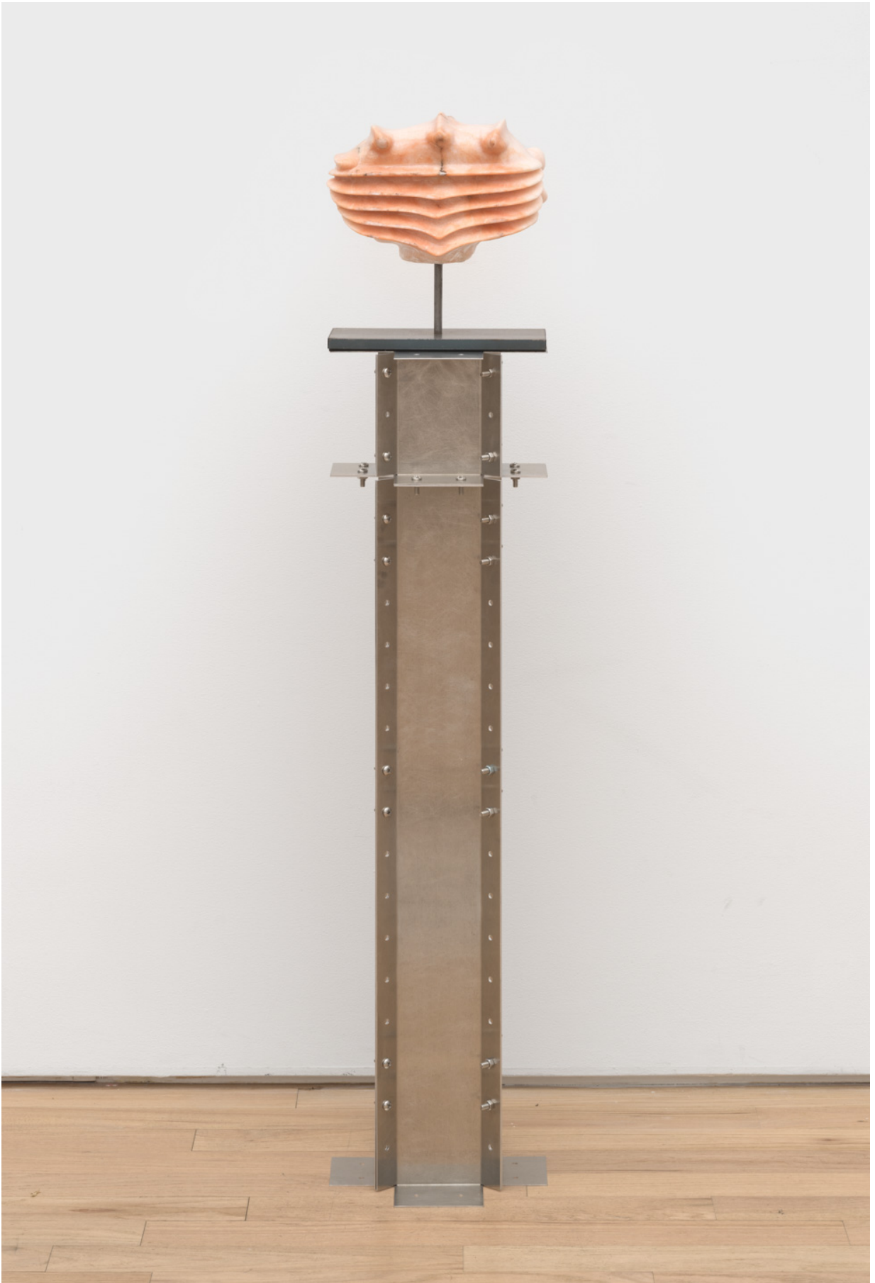
Conservation of Mass, 2026, alabaster, wisdom tooth, steel