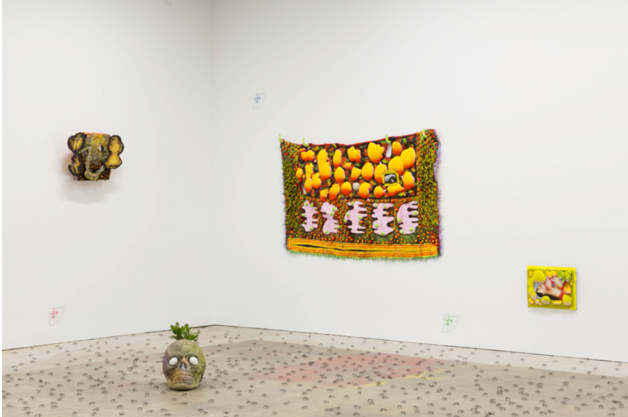
Install shot of the group show Mallrats curated by 100% Gallery and held at Et al etc., San Francisco, CA.