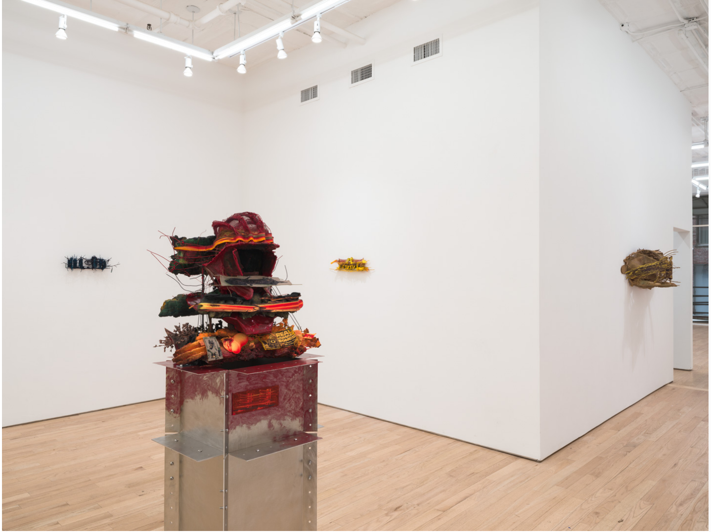
Leech, 2026, paper pulp, epoxy putty, wire, window screen, collage, acrylic, lead, wood