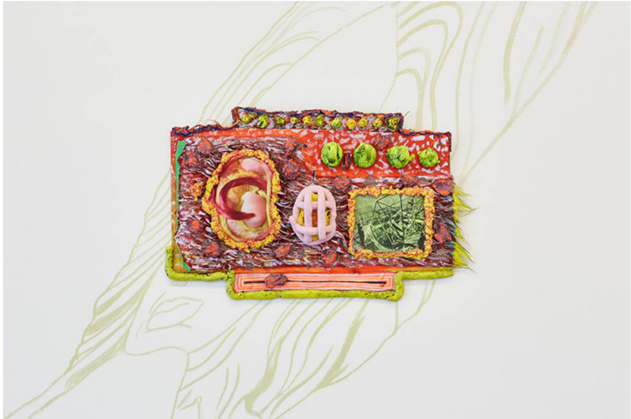
Kari Cholnoky, Case Study , 2017, Faux fur, acrylic, collage, cardboard, 15" x 23" x 4"

chalky. When I think about these colors I'm thinking about heat-sourced imaging, poisonous natural material, camouflage, defense mechanisms, fear, and My Little Pony.