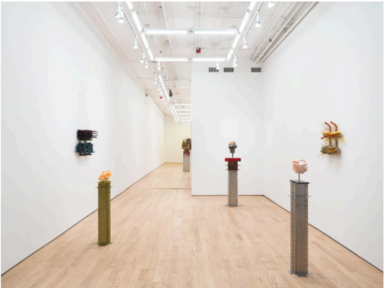
Kari Cholnoky, "Leech," installation view