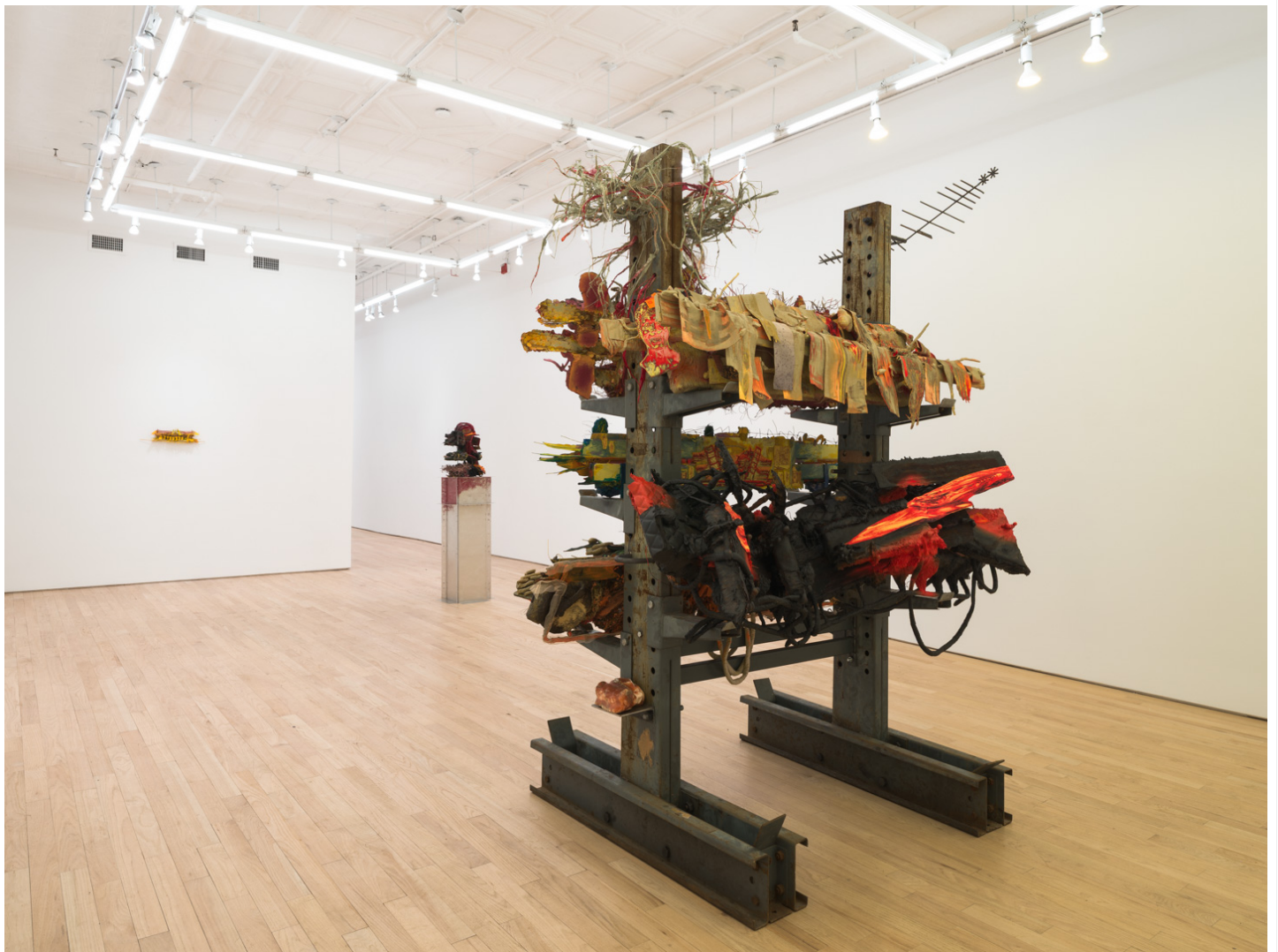
Installation view featuring Leech (left, background) and Center of Gravity, 2026, faux fur, acrylic, collage, epoxy putty, wire, blood, bronze, steel

The elongated, horizontal form is characteristic of Cholnoky's work, on grand display in Center of Gravity – a towering piece anchoring the show in the back gallery. Five horizontal paintings are mounted on a two-legged steel rack, three across the front and two across the back. The works suggest the cycle of growth and decomposition and therefore the passage of time. One horizontal form is dated 2018–2026, leaving no doubt that Cholnoky earns the transformation she means to impart. Spotlights surround Center of Gravity with a yellow hue, softening the steel rack and shifting the sense of the piece from hulking shipyard storage to inviting warm bath. Cholnoky's fusion of painting and sculpture, figure and landscape, image and instinct is complex and generous, expansive and searching.